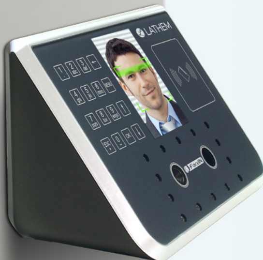
Patented Incline Design

A complete time and attendance system that uses face recognition technology to instantly identify users. These time clocks provide a touch-free, hygienic alternative to fingerprint and hand readers, while still eliminating "buddy punching" and the need for cards or badges. Users simply look at the device and within seconds they are identified and clocked in for work.