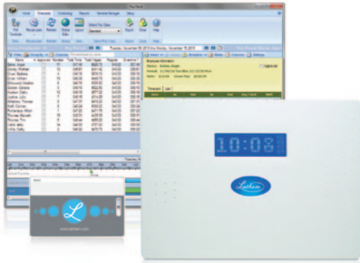
PC50 Time & Attendance System

This automated time and attendance systems offers big business efficiency at a small business price. Lathem's PayClock PC60 automatically calculates worked hours including overtime as well as providing the tracking of benefit time for 100 employees (and can be easily expanded to 1,000). The PC50 all of the same features for up to 50 employees. Employees use proximity badges to punch in and out. Supervisors can add employees, edit punches and message employees for fast and effective workforce management. At the end of the pay period comprehensive payroll and attendance data can be viewed on the screen, printed to reports, sent to Excel, or exported directly into your existing payroll software for a seamless punch to paycheck solution.