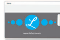
Extra Employee Badges