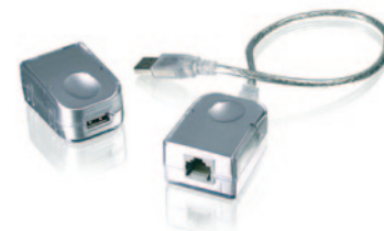
USB Super Extender