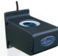
Biometric Finger Sensor