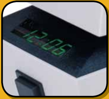
Optional Digital Display & Manual Align Push Button

The LT Series Stamps help you keep track of incoming mail, legal documents, freight bills and customer pick-ups, invoices and payments, or any other sensitive document. Without a doubt, a Lathem LT is the fastest, easiest, and most efficient way to keep up with all the "ins and outs" of your business.