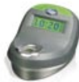
TS100 Fingerprint Reader